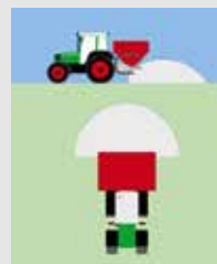
DISC TYPE SPREADER PATTERN: Material is subjected to wind influence. The flat pattern requires precise overlap.