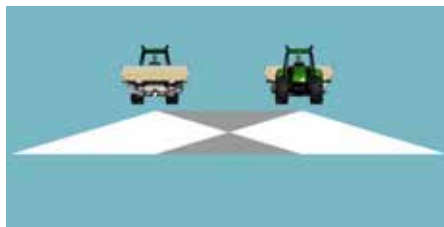
Up to 79' working widths