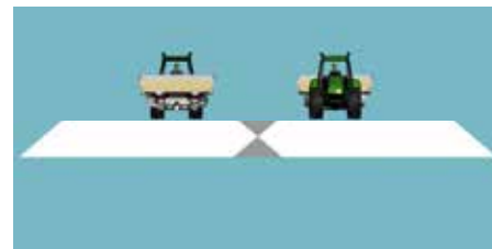
From 79' working widths