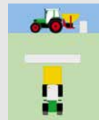
PENDULUM SPREADER PATTERN: Wind influence is negligible. Tractor does not get covered with fertilizer.