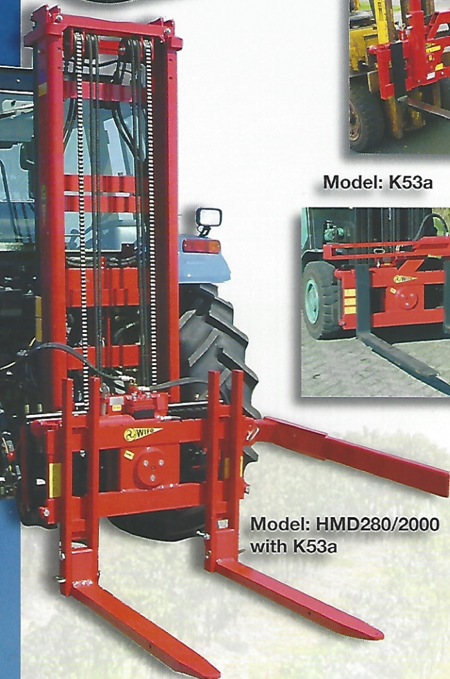
Model: HMD280/2000 with K53a

They all have a rotating turn of 180° to the left and come with or without an integrated side shift. The side shift can move 8" (20 cm) and works with an electric valve which will switch the oil flow from the rotator to the side shift by pushing the button. They are supplied with a heavy duty rotating shaft and industrial type bushings. Models K53a and K53c are available with fixed or folding side arm and models DKB and DKD come standard with folding side arm.